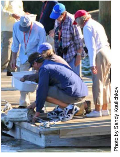
What's down there?: Master Naturalists study the organisms that colonize floating docks.

ists go on to provide volunteer service for a number of causes and organizations throughout the area. There are now 414 graduates of the Master Naturalist program, and their volunteer service means that LCI's mission and message are exponentially disseminated throughout the lowcountry. Master Naturalists work with school children, act as docents for nature centers, help care for nature trails, count birds, make land use decisions, conduct citizen science, educate others, and lead many local organizations. Through the Master Naturalist program, LCI can efficiently and effectively communicate the message of our region's unique characteristics, the importance of our waters and salt marsh, and the ethic of conservation.