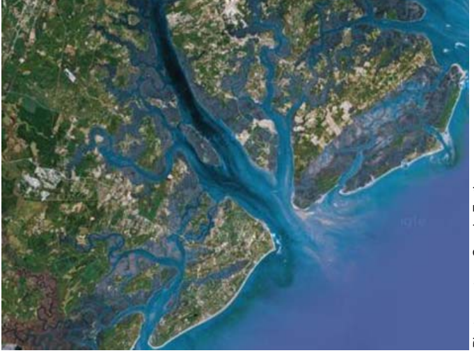
The Port Royal Sound Watershed

Nesting success was not higher on platforms compared to other nest locations. Compared to 2009, the rate of nest success (nest success being defined as producing at least 1 or more chick during the season) was higher in 2010. There are a variety of possible reasons for this, and data from upcoming seasons will help provide important information about the relationship of population numbers to the health of the Port Royal Sound system.