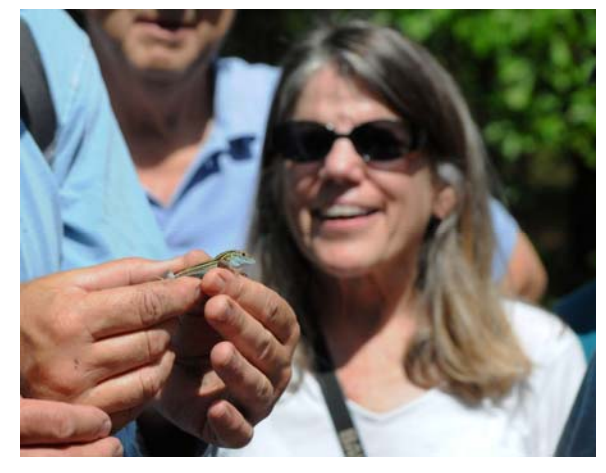
Fence Lizard Fun: During a field session at the Audubon Society's Beidler Preserve, Master Naturalists learn about the fence lizard.